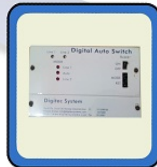
Digital Auto Switch - ATS