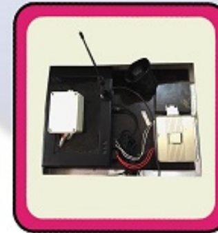
Shops Security system