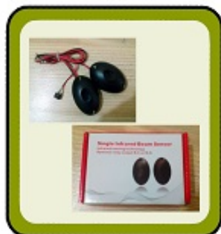
Single Laser beam system