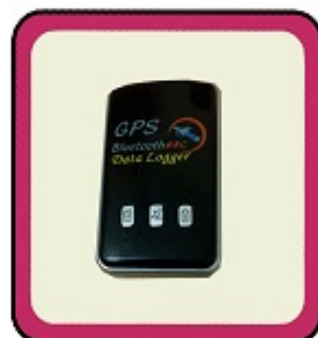
GPS Data Logger